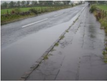
The dip in light rain