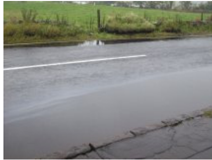
The dip in light rain flooding begins