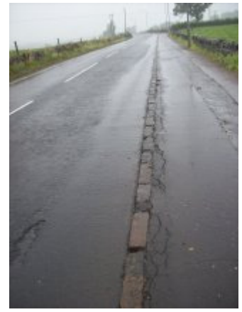
Water running alongside kerb in light rain