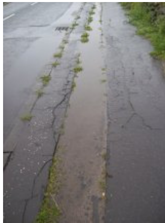
Pavement surface in light rain