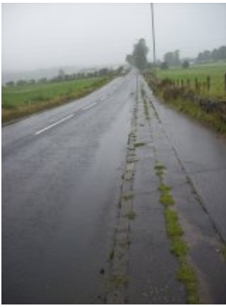
Kerbside in light rain