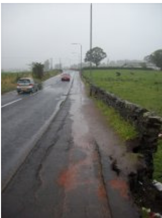
The pavement in light rain