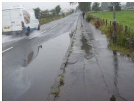
The dip in light rain