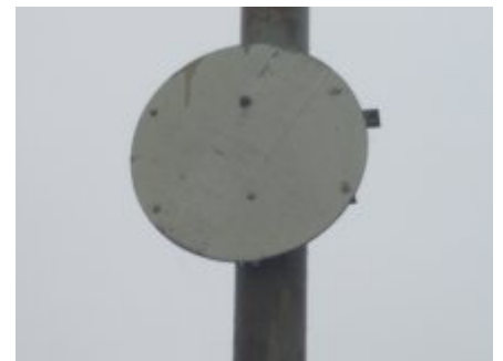
Speed limit sign