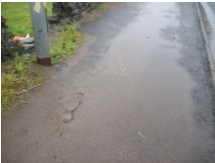
Deep puddle in pavement in light rain