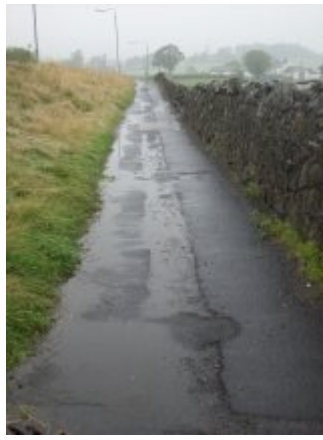
Flooding on approach to school