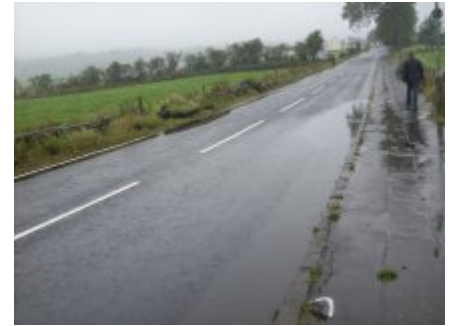
Second flooding point